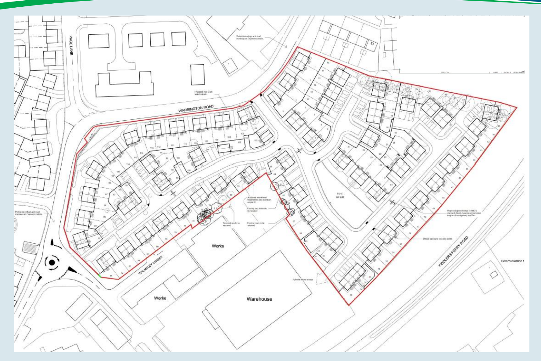
Application Number: 17/00504/FUL