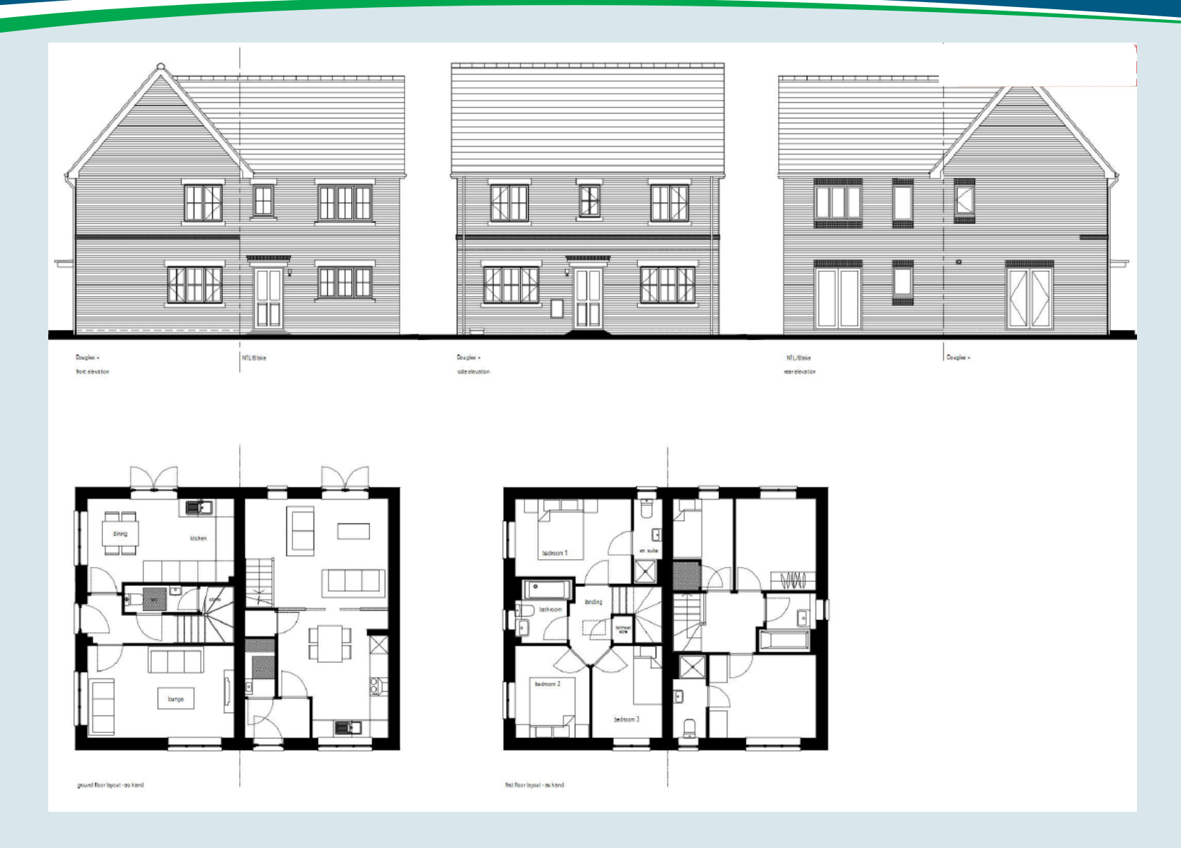
Plan I D: House Type C – Floor & Elevation Plan