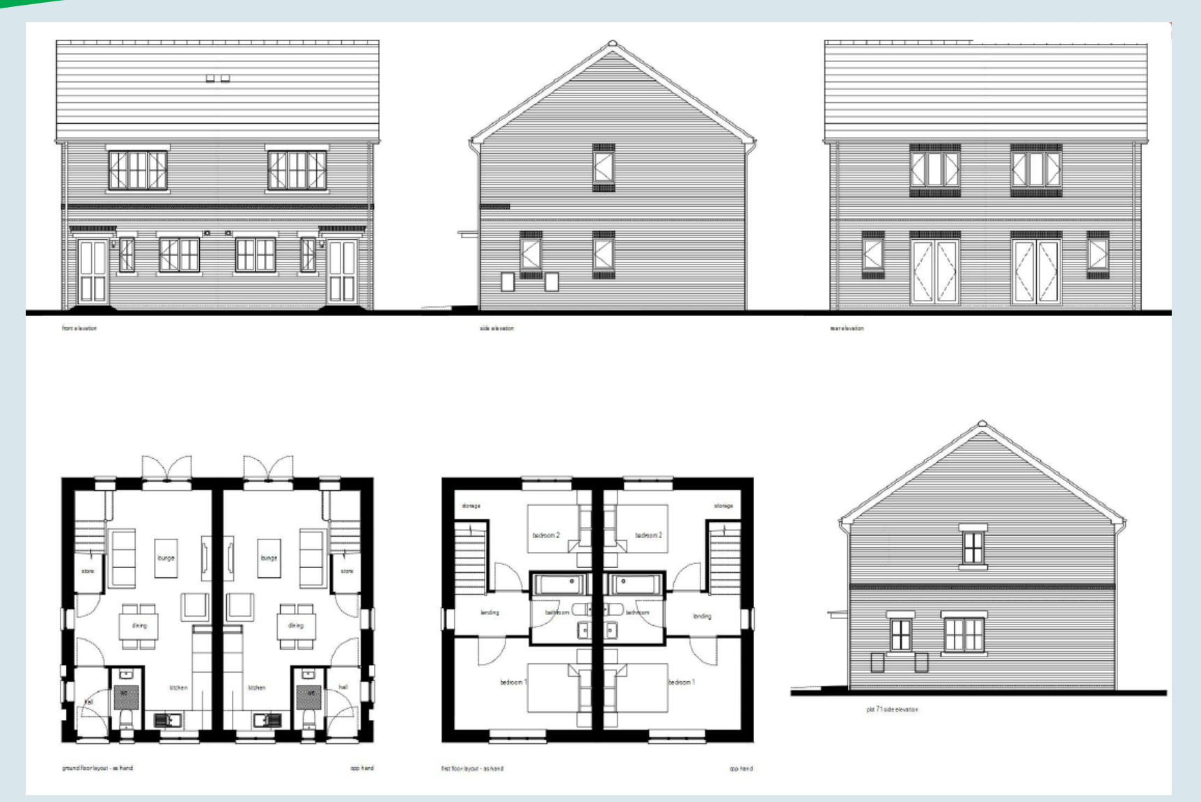
Plan I C: House Type A – Floor & Elevation Plan