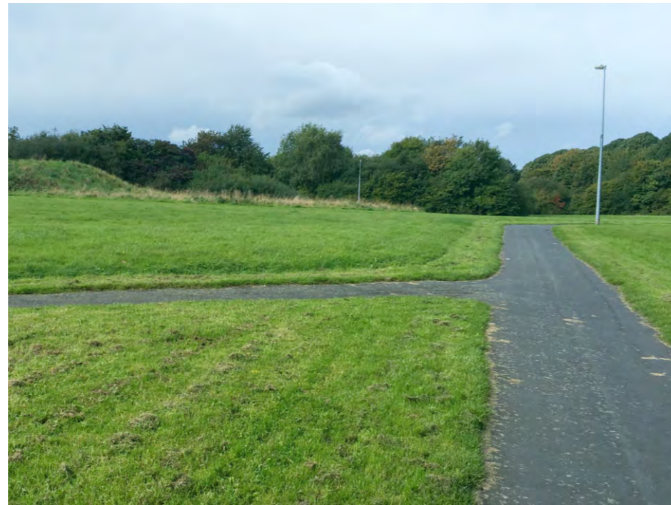
10. Lack of directional signage - existing footpath cycleway towards Halton Lea.