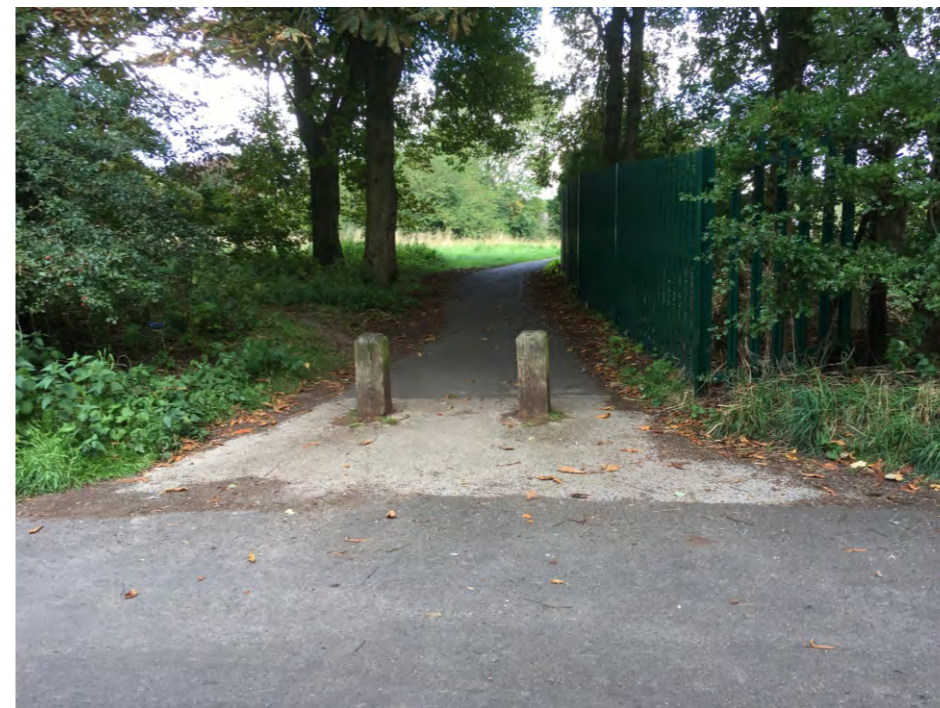
7. Lack of signage - pedestrian entrance to Town Park from Stockham Lane.