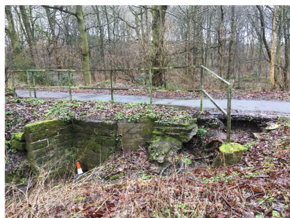
19. Existing brook headwall in poor condition.