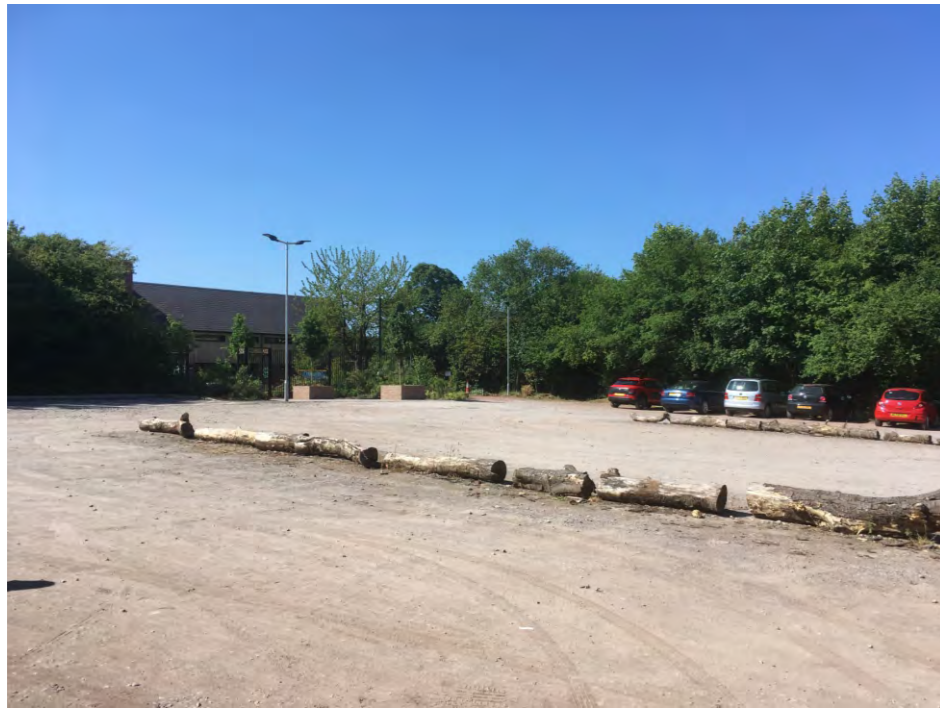
9. Poor arrival experience - existing unsurfaced car park at Norton Priory.