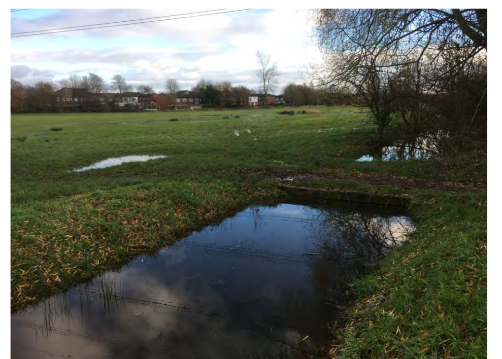
20. Ditches at full capacity.