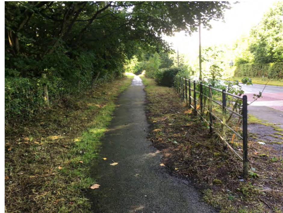
11. Poor connections through the park across the Busway.