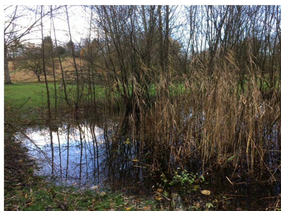
18. Overgrown vegetation obscuring and reducing capacity of ponds.