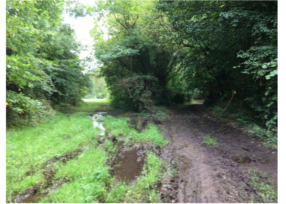
4. Lack of path surfacing connecting routes through the park.