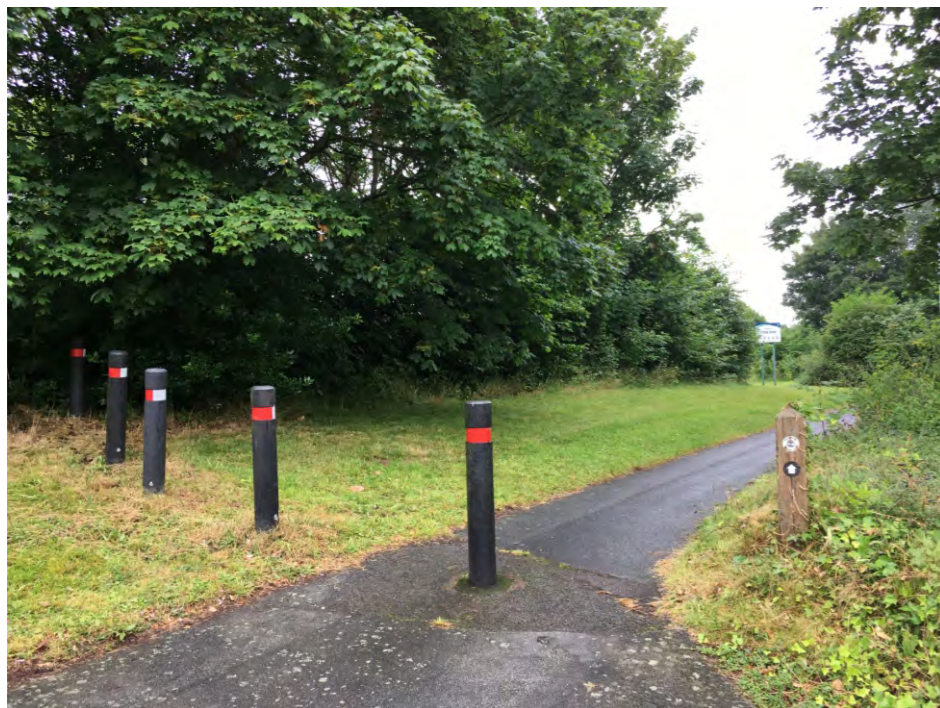
5. Poor impression - entrance to Town Park from Holt Lane and Shopping City.