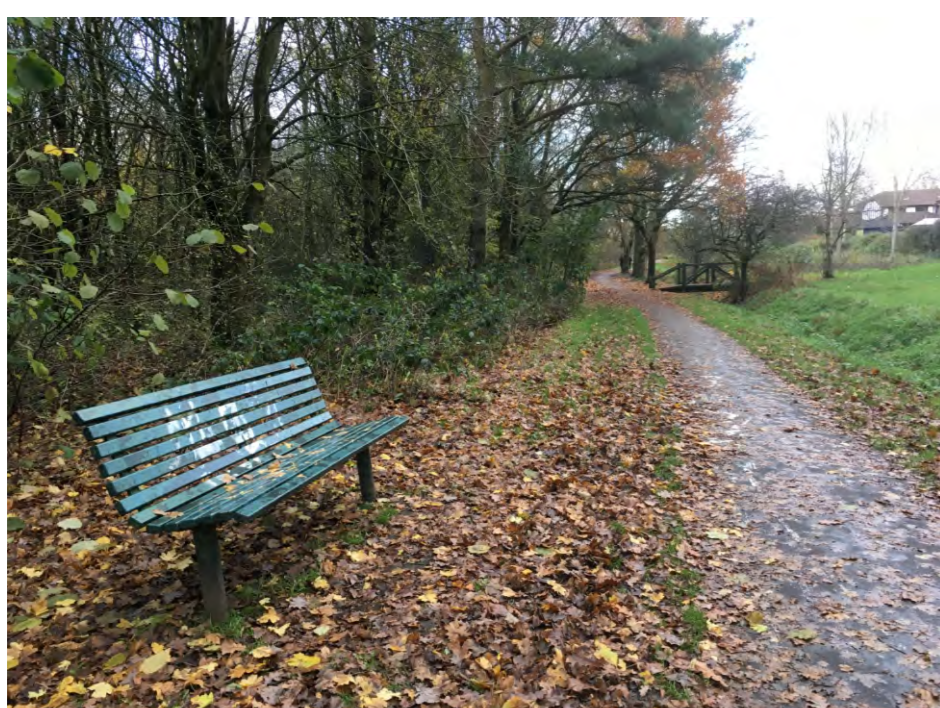
17. Existing seating in poor condition. Lack of seating in some areas.