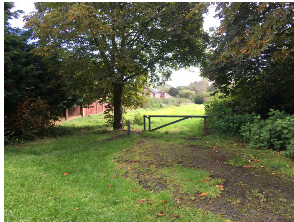
6. Lack of entrance definition - Town Park from Palace Fields Avenue.