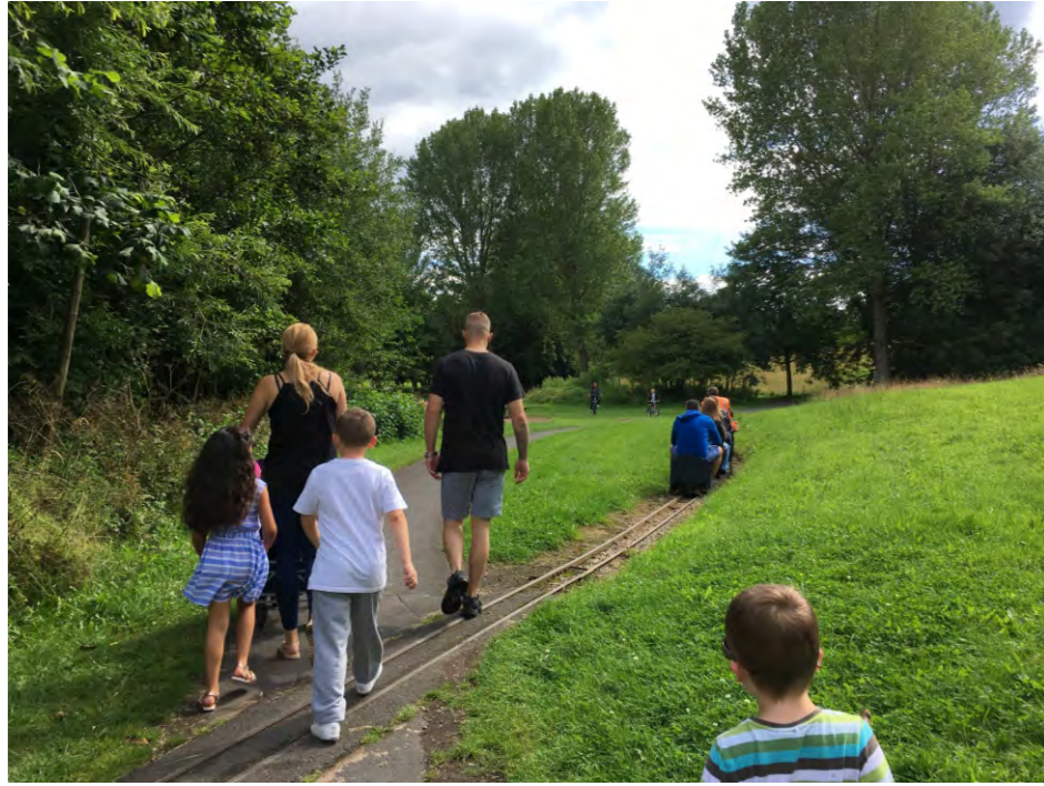
1. Original park footpaths and cycle routes are of insufficient width for current level of usage.