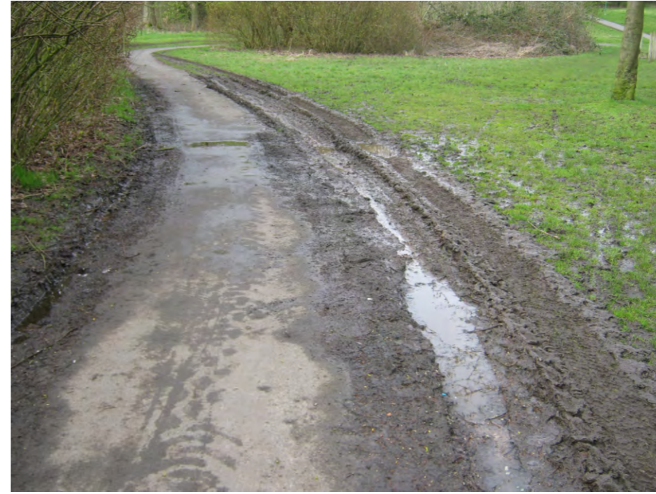
3. Existing path surfacing of insufficient width to allow for maintenance access through the park.