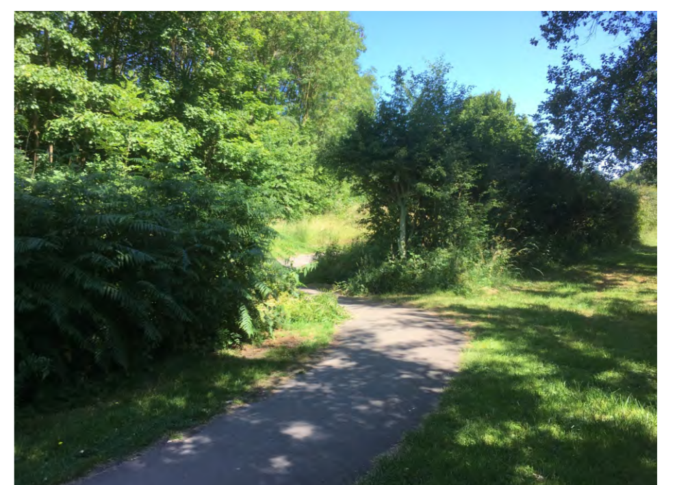
16. Original mature hedgrows restricting visibility along footpath and cycle routes.