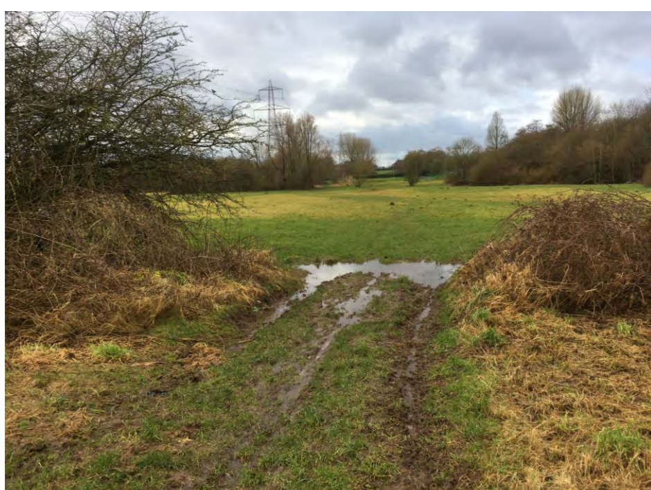
13. Lack of maintenance access and poor path connections through the meadows.