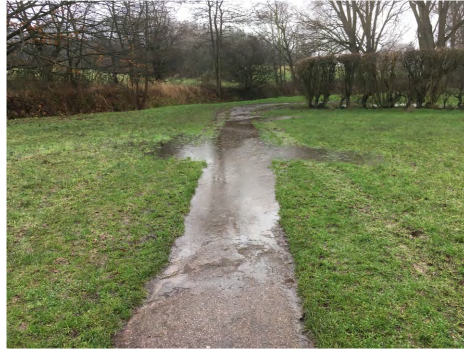
2. Footpath drainage problems.