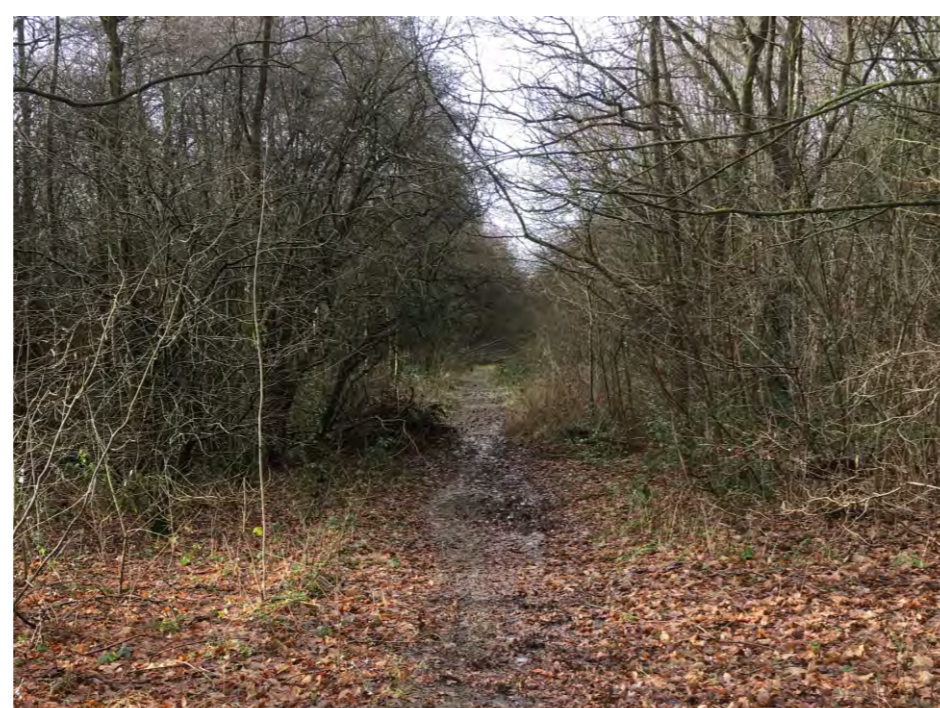
14. Opportunity for improved woodland access including interpretational signage.