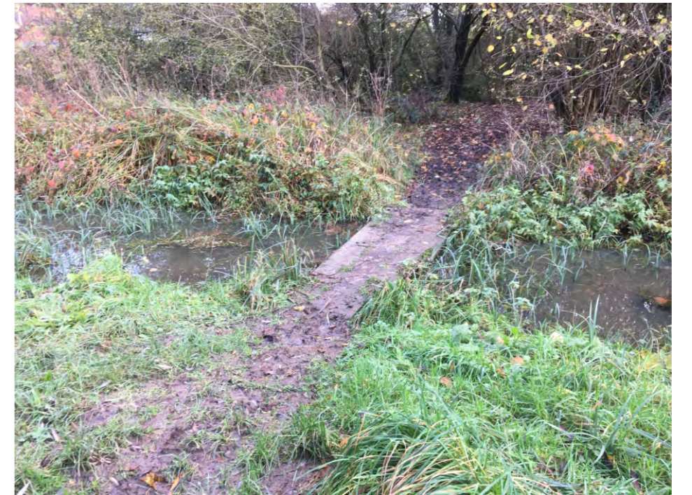
12. Low quality bridged connection linking the park to local neighbourhoods.