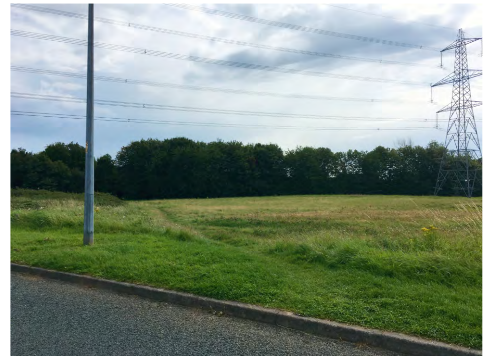
8. Lack of protection - the boundary to the park along Tower Lane.