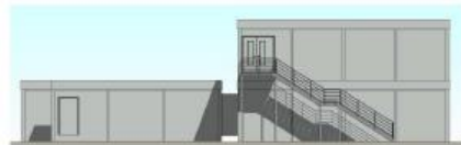
3 East Elevation 1 : 200