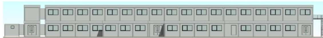
2 South Elevation 1 : 200