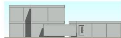
4 West Elevation 1 : 200