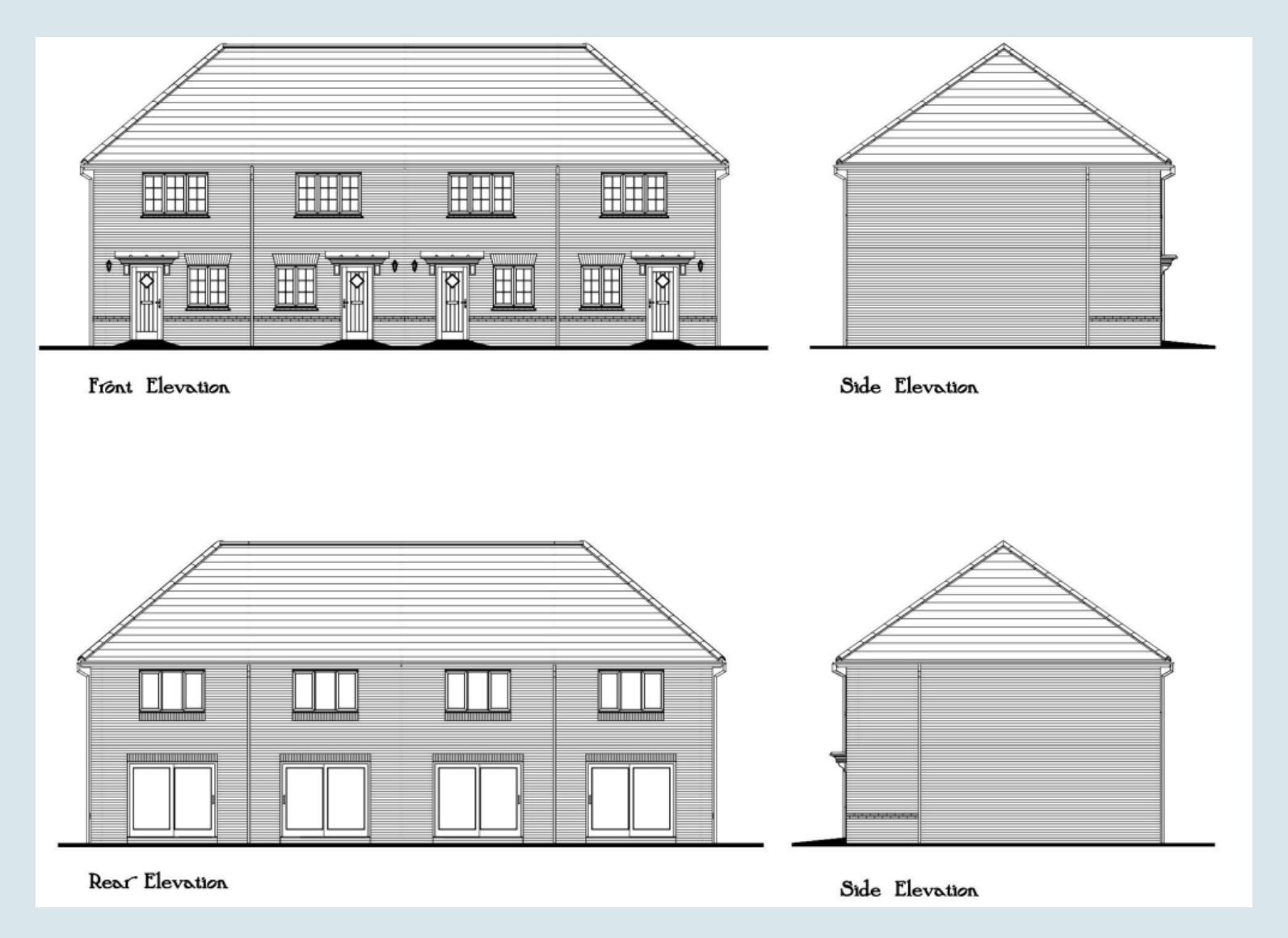
Application Number: 22/00178/FUL