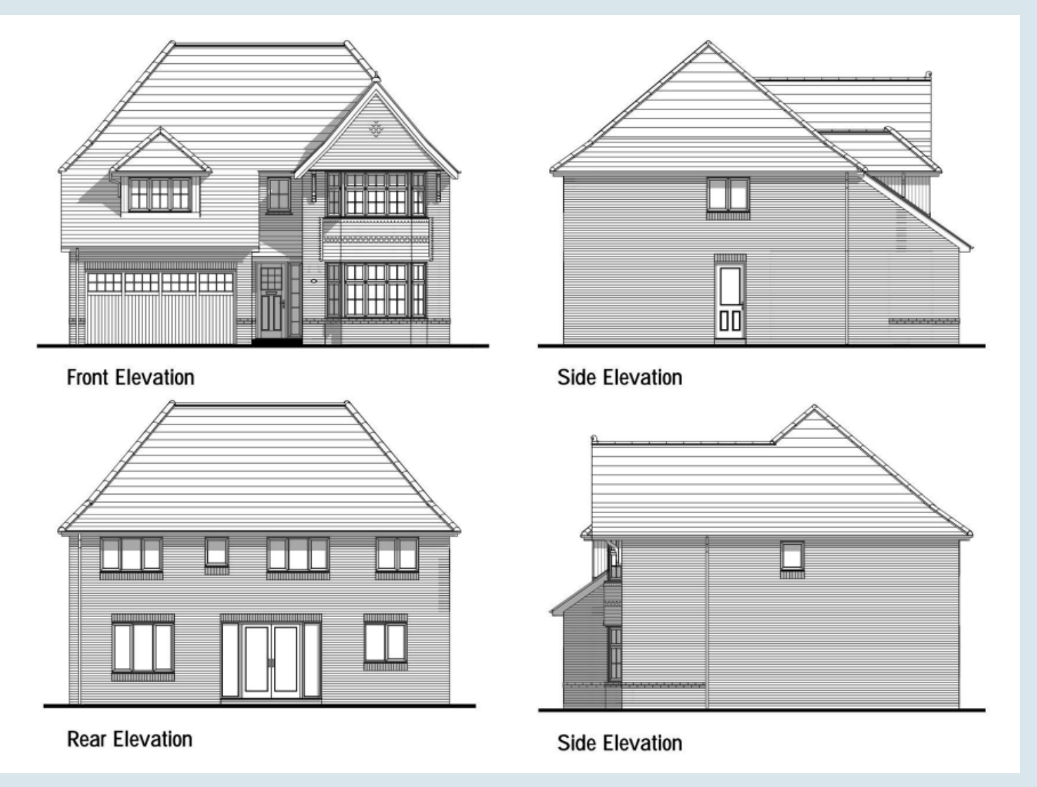
Application Number: 22/00178/FUL