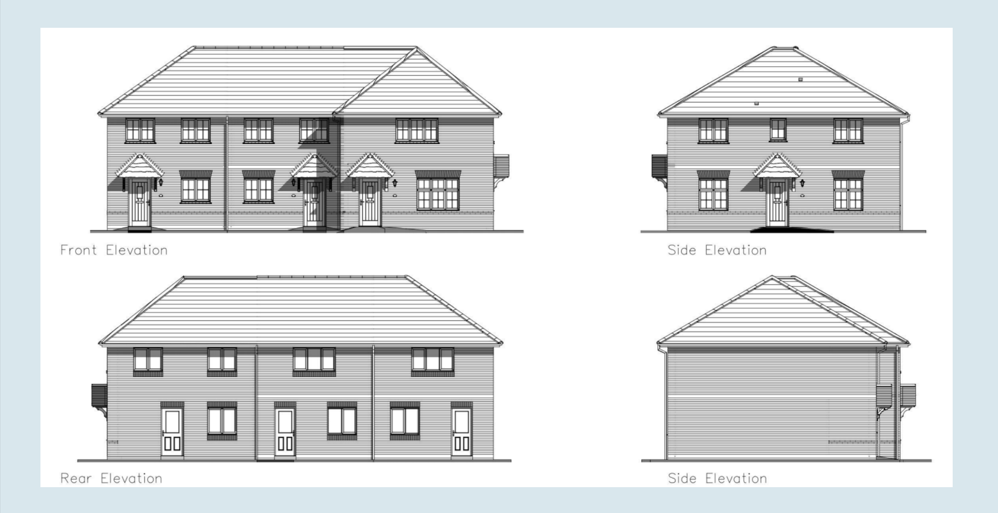
Application Number: 22/00179/FUL