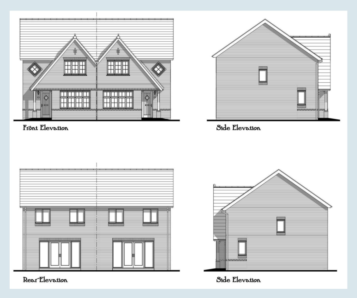
Application Number: 22/00179/FUL