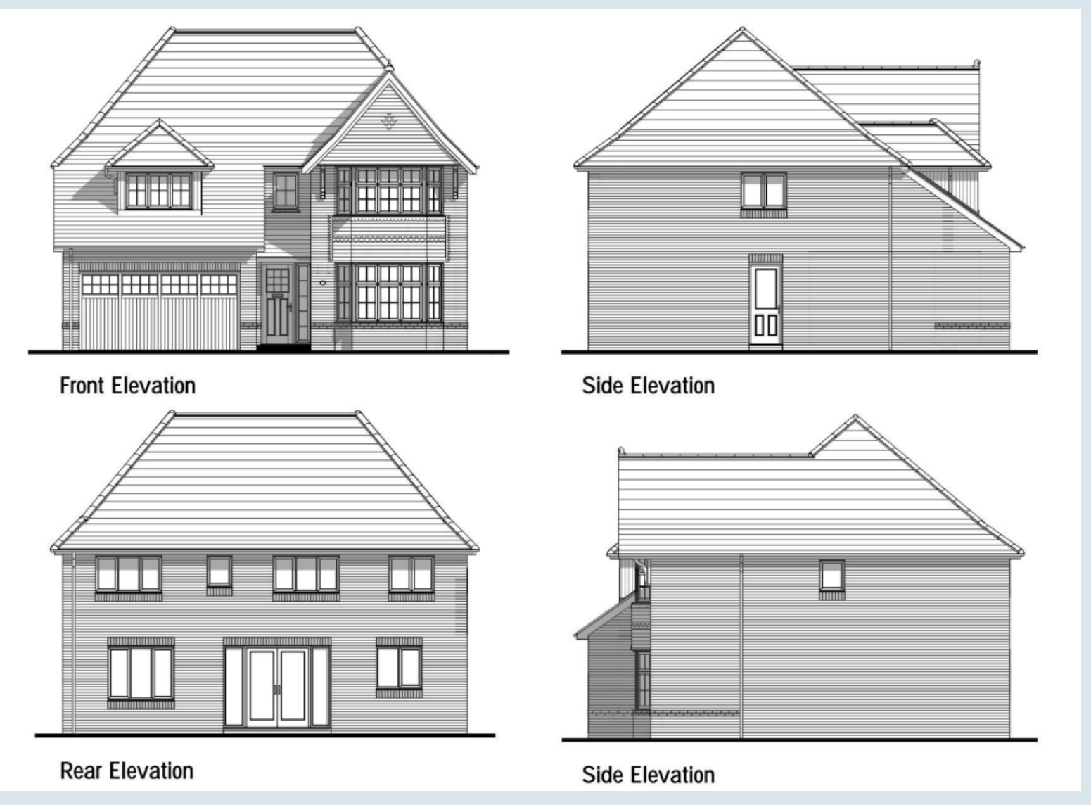
Application Number: 22/00179/FUL