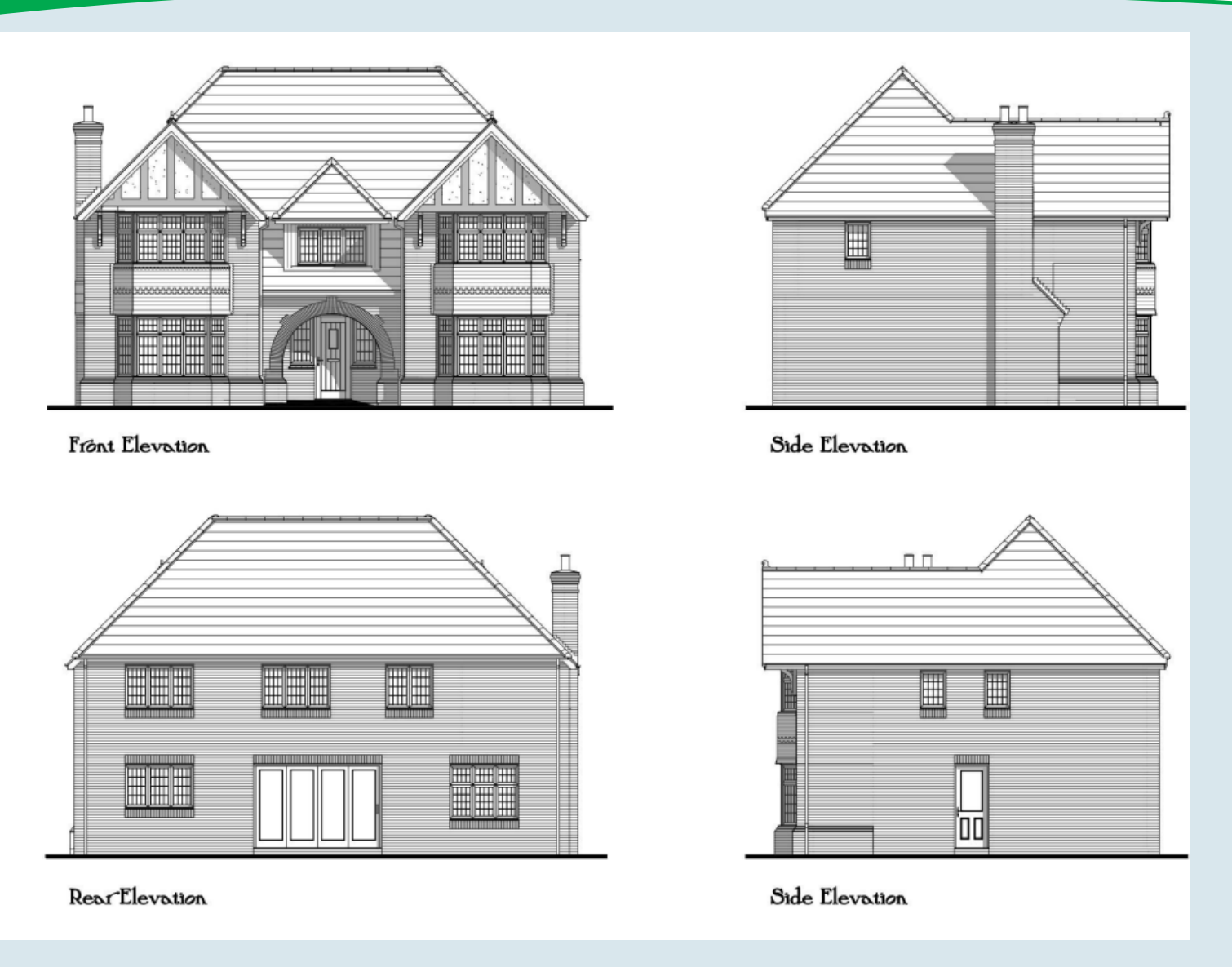
Application Number: 22/00178/FUL