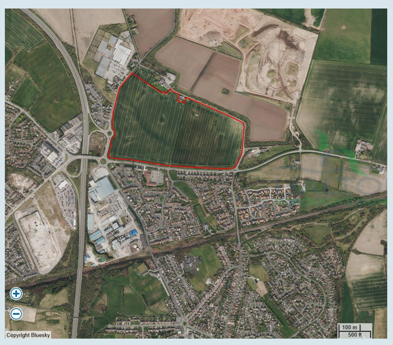
Application Number: 22/00178/FUL