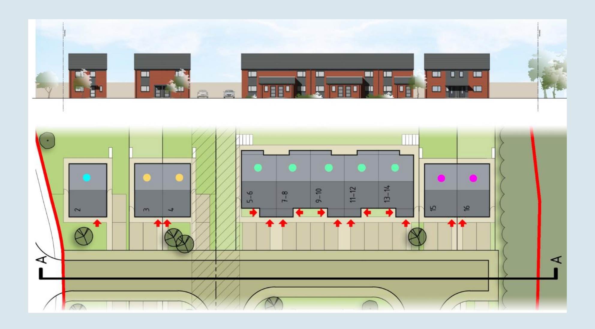
Application Number: 22/00005/FUL