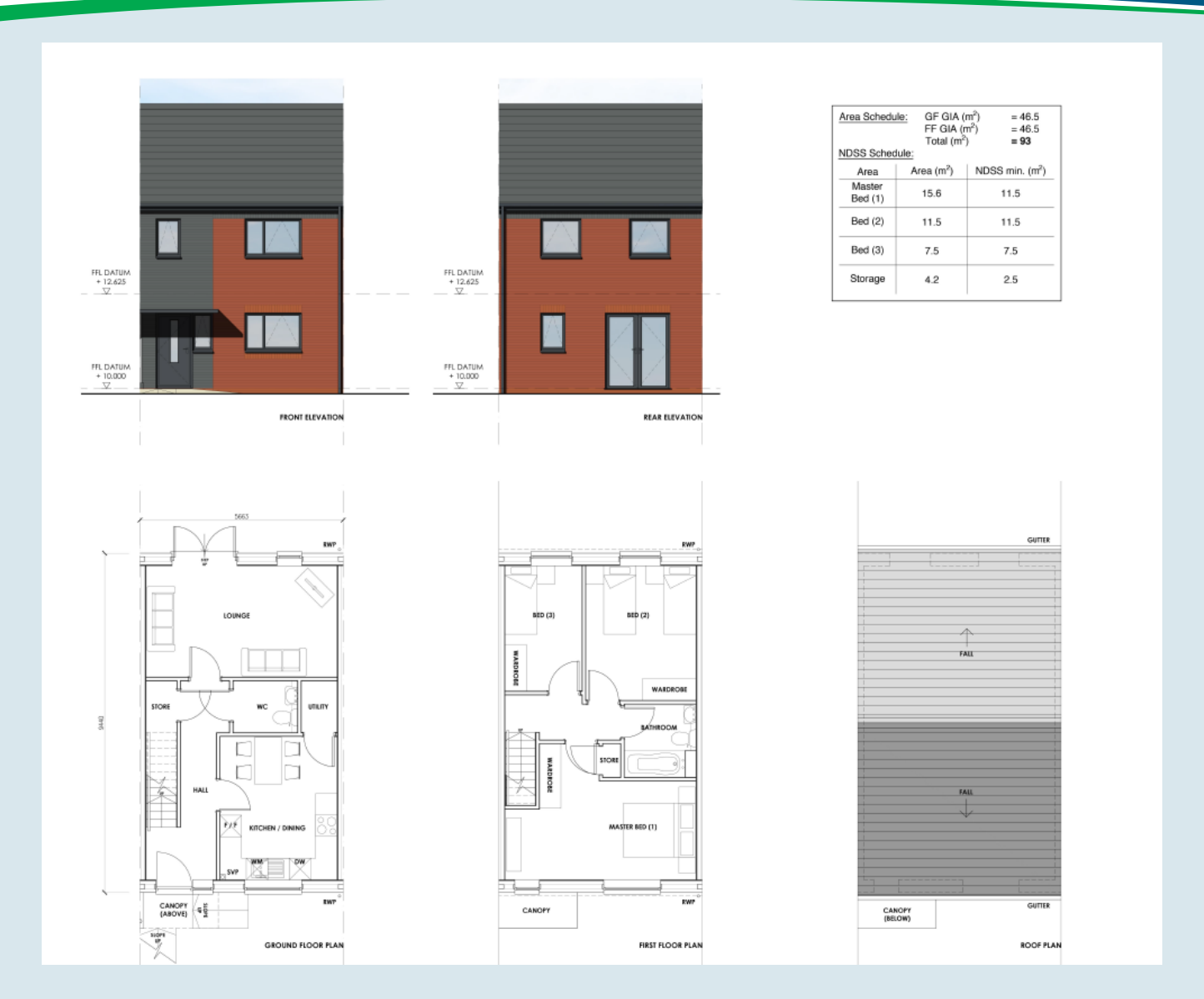
Application Number: 22/00005/FUL