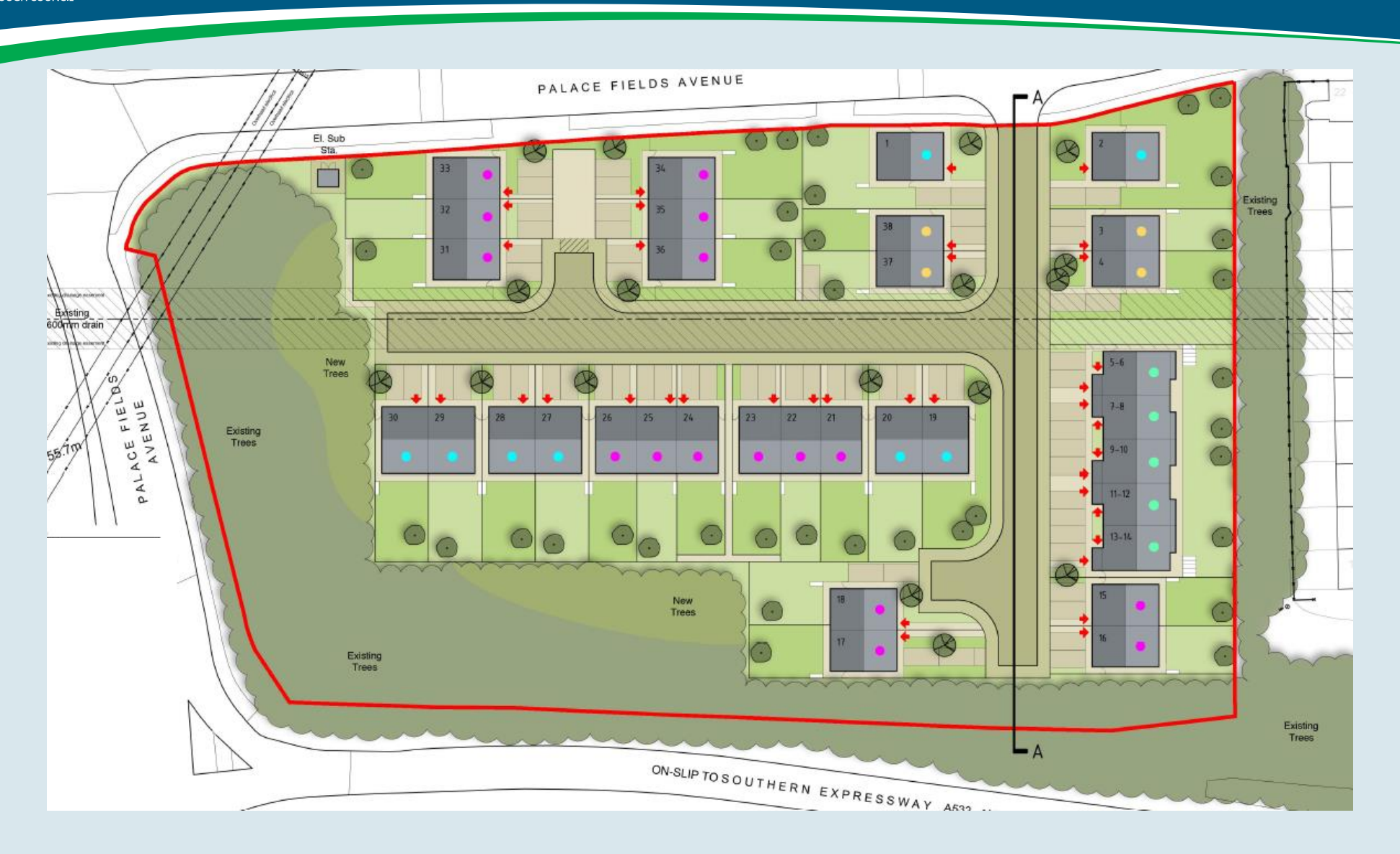
Application Number: 22/00005/FUL