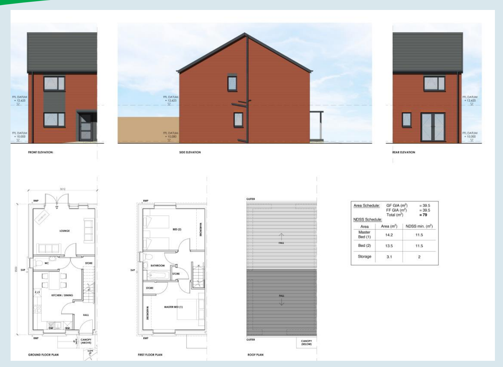
Application Number: 22/00005/FUL