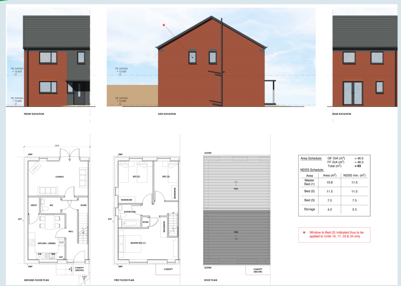
Application Number: 22/00005/FUL