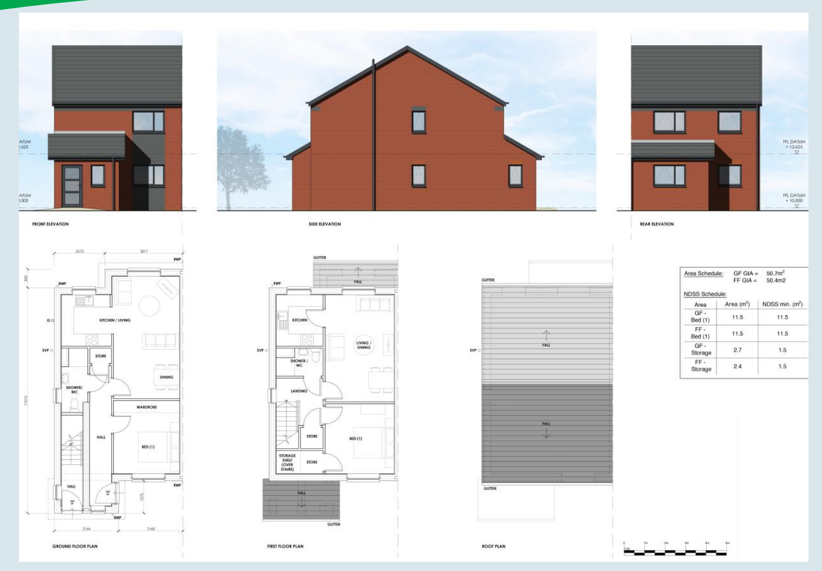
Application Number: 22/00005/FUL