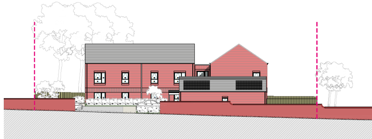
Proposed Street Elevation - Crow Wood Lane

EXISTING / PROPOSED STREET ELEVATIONS - 3No. M4(3) Bungalows & 10No. M4(3) Apartments @ 1:100