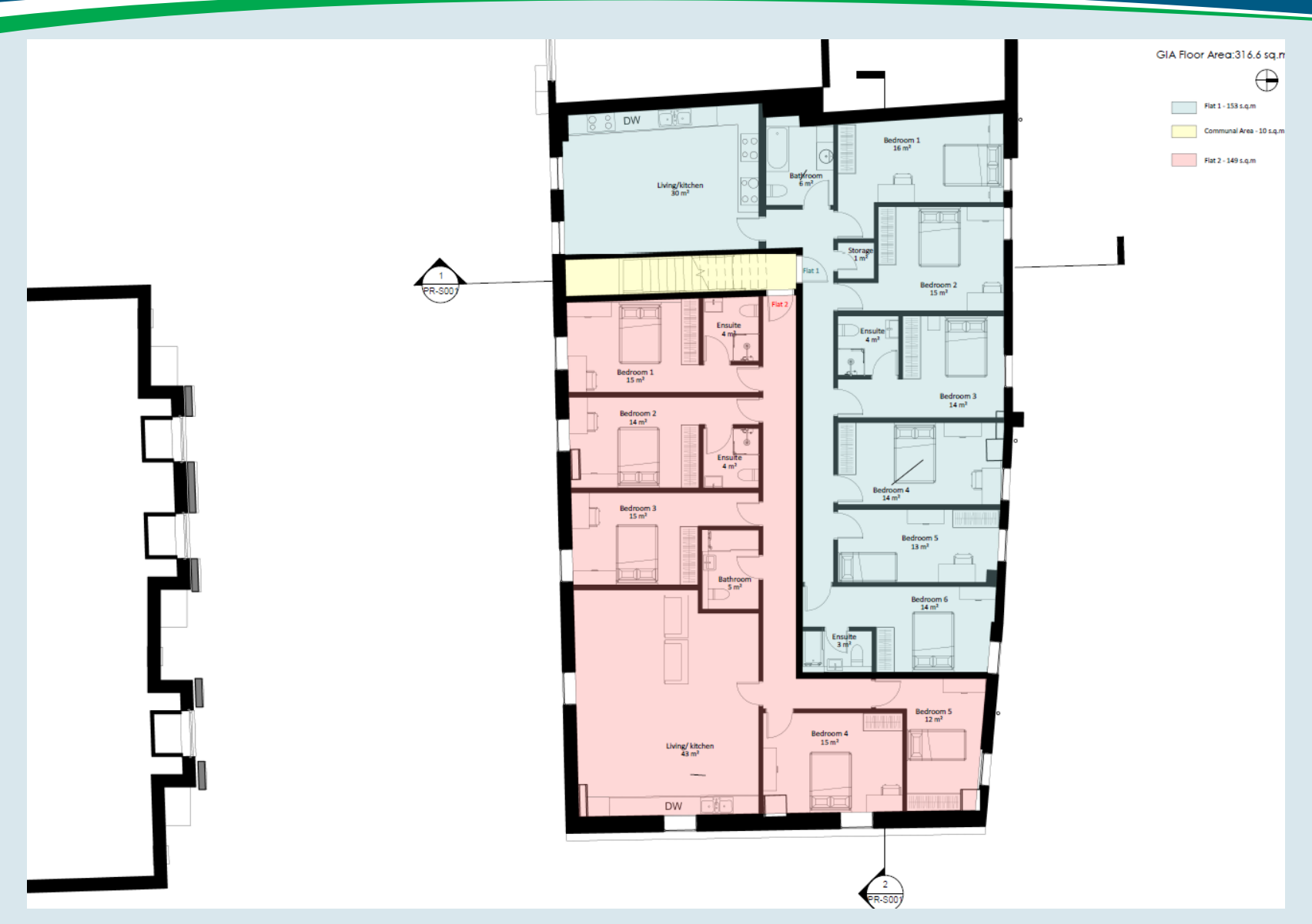
Application Number: 25/00088/PRIOR