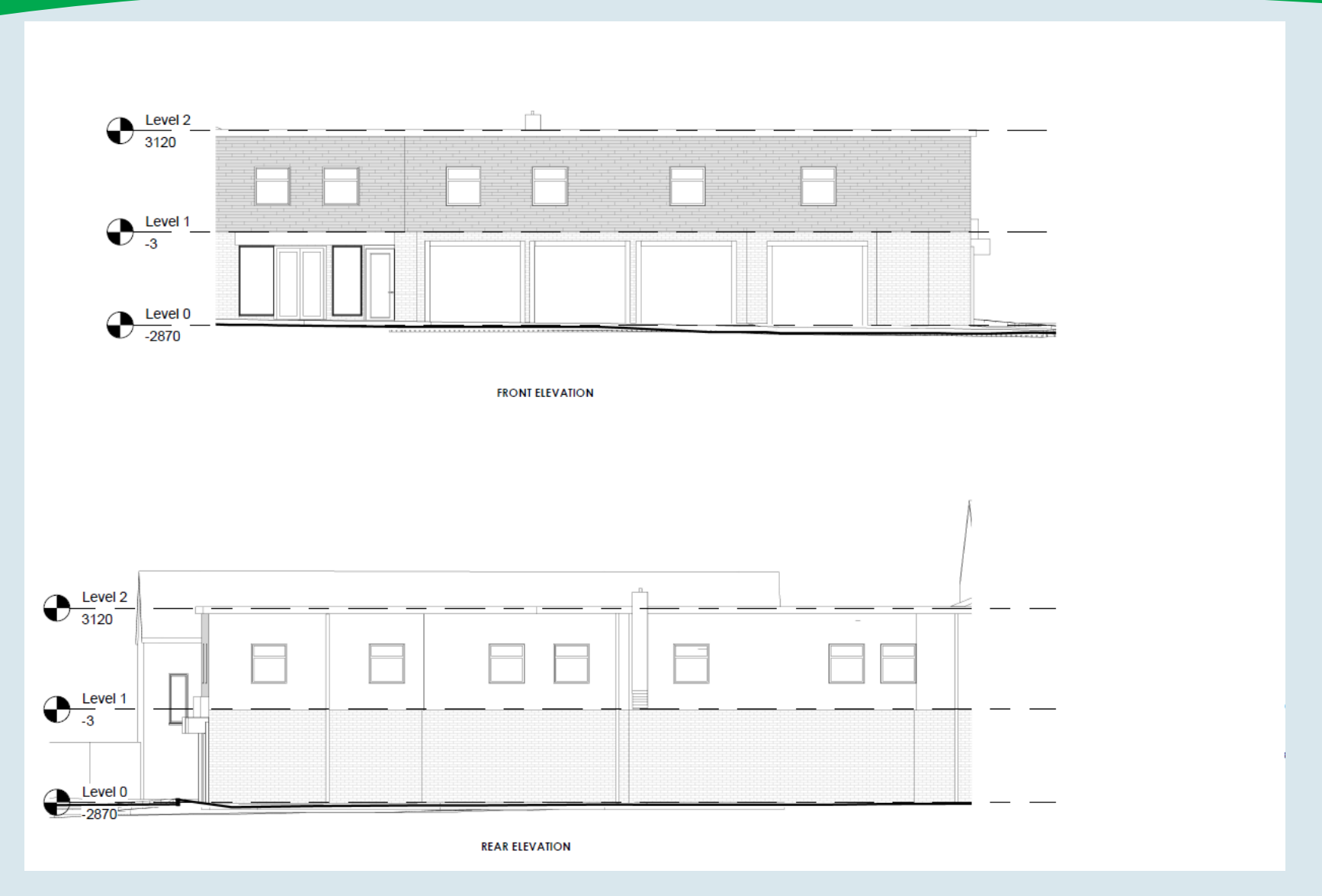
Application Number: 25/00088/PRIOR