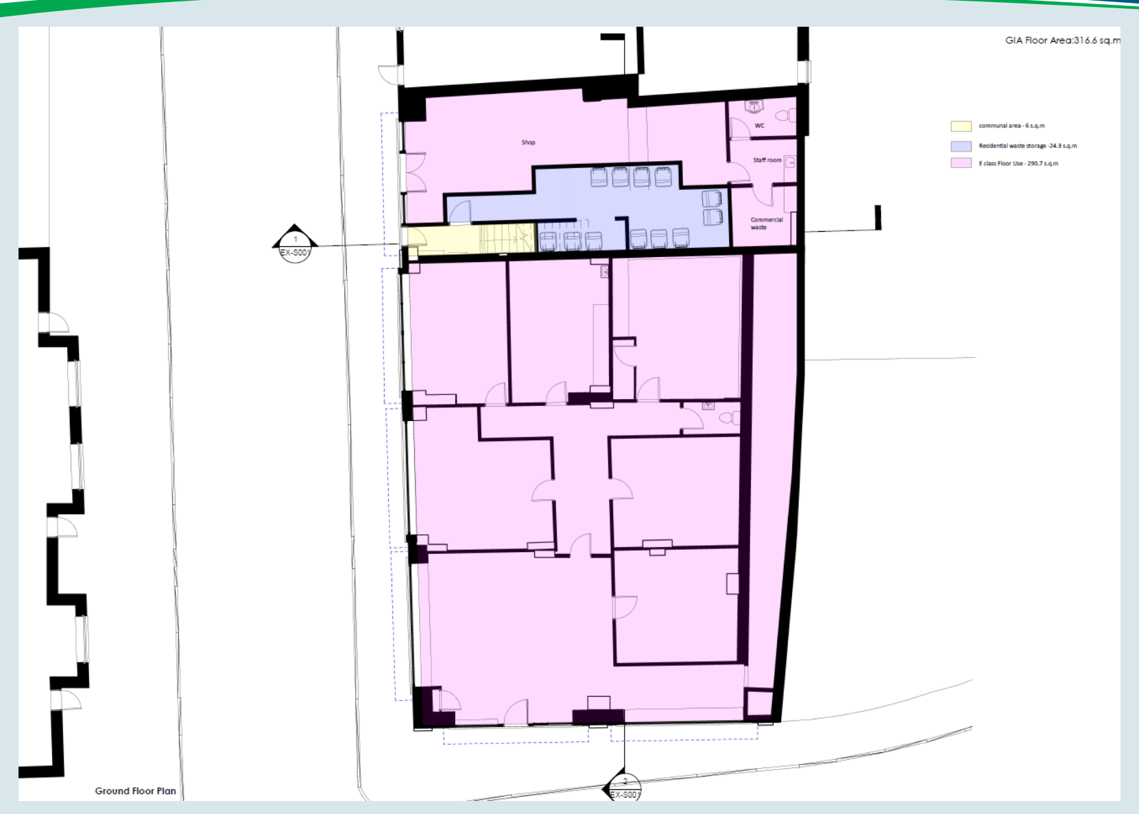
Application Number: 25/00088/PRIOR