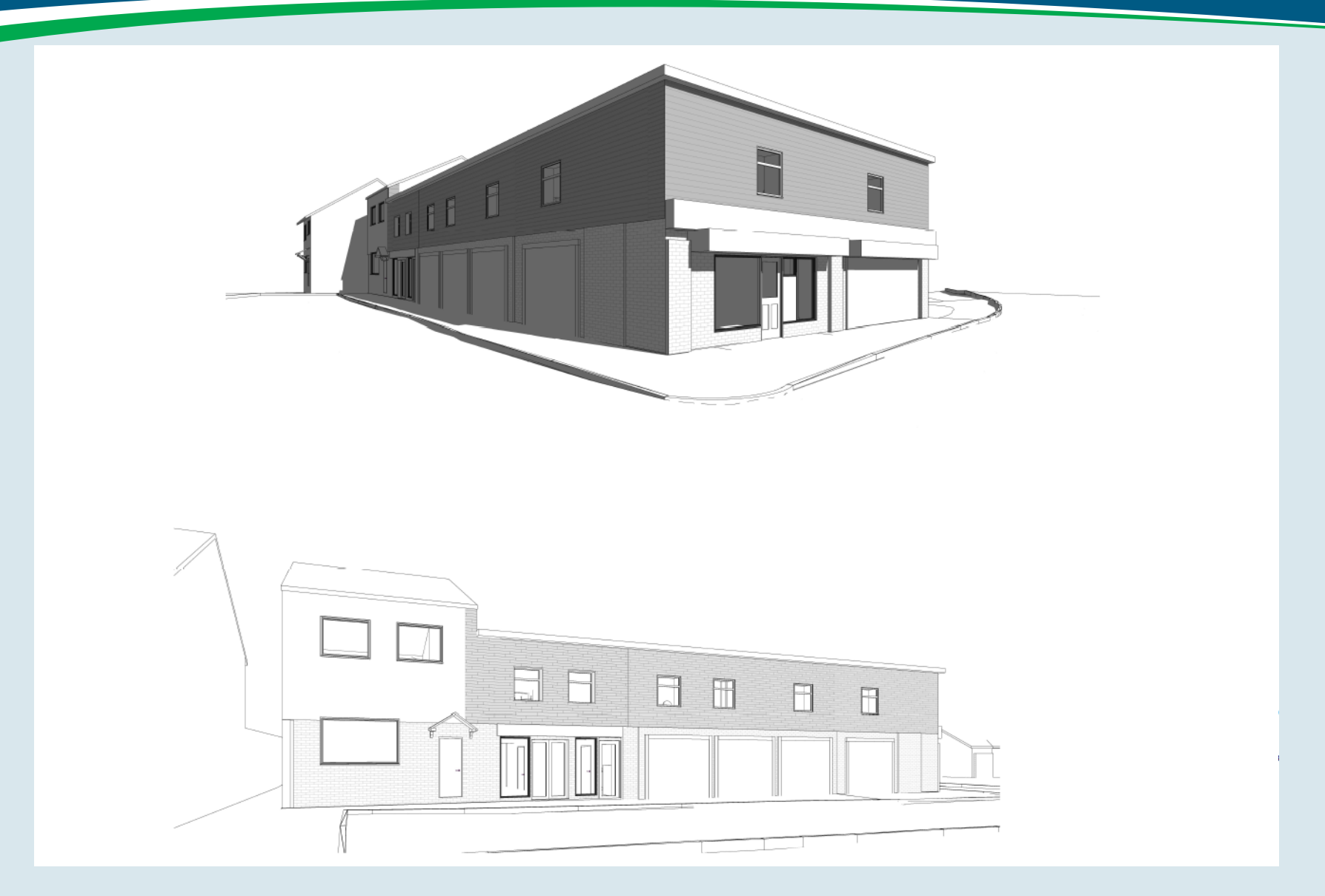
Application Number: 25/00088/PRIOR