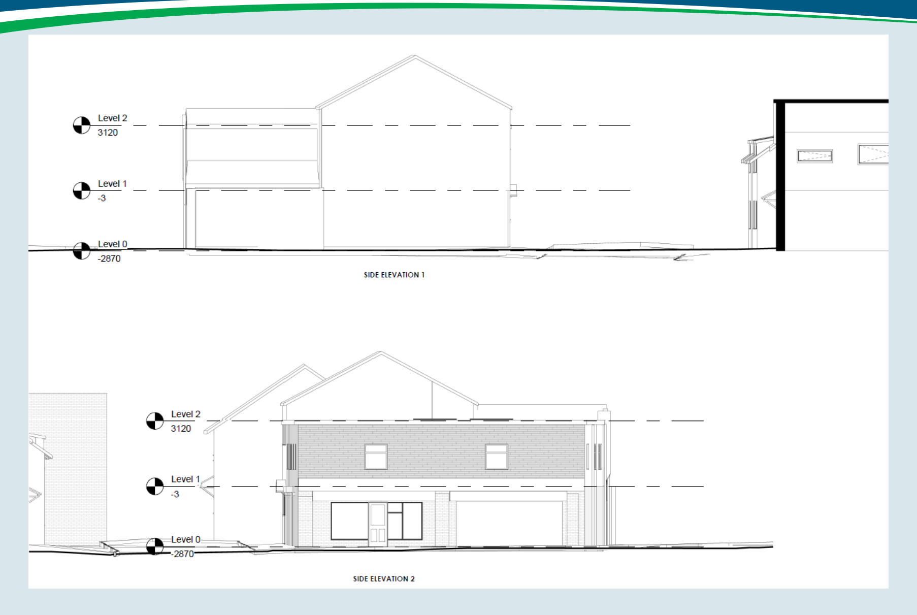
Application Number: 25/00088/PRIOR