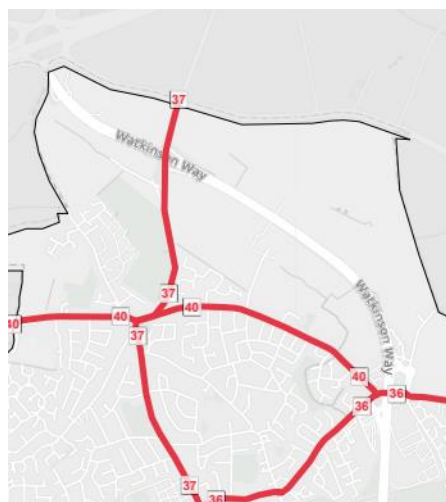
Map 1 – North Widnes Active Travel Routes